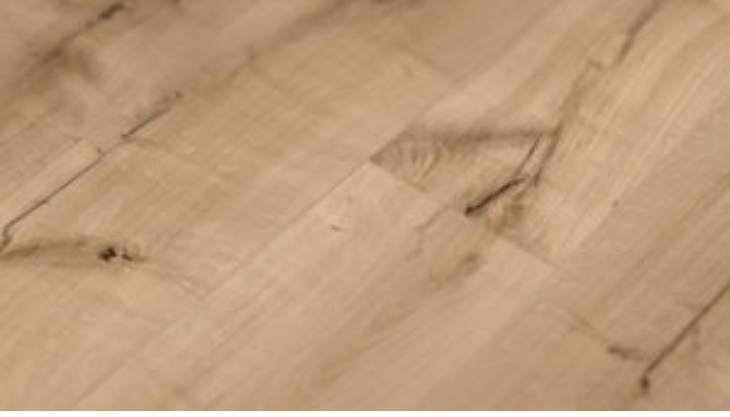
Oak Santa Cruz