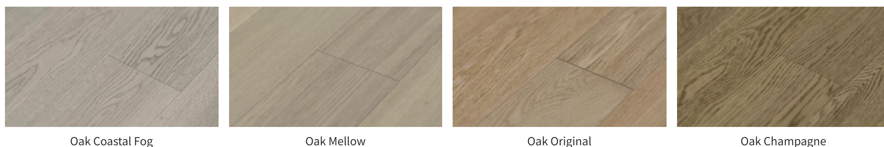
Oak Coastal Fog

Dimensions: 1/2" (thickness) x 5" (width) x 48" (length)